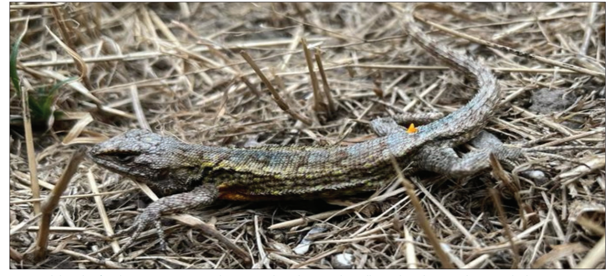
Fig. 1. Adult male of Sceloporus grammicus with emaciated condition at El Cerrillo, Piedras Blancas, Toluca, Estado de México, México.

Body condition is an ecological term used to denote the physical state or quality of an individual, usually serving as an indirect measure of energy status, this is, the amount of energy reserves (fat stores) available in one animal (Sion et al. 2021).